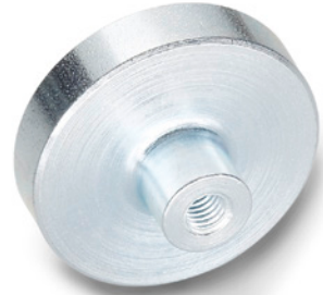
View on adhesive surface

- More information to retaining magnets (see page 2022)